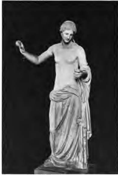
Fig. 33. Venus of Arles.

a delicate purple flower that grows plentifully in the Greek meadows in the spring of the year. In this story Adonis is the springtime, killed by the fierce heat of summer. Each year in commemoration of his death the people went through